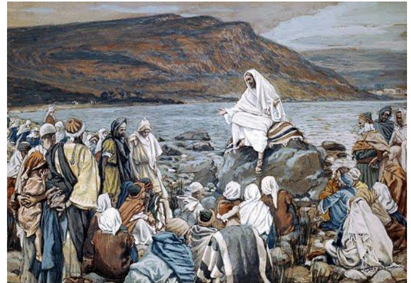
Jesus Teaching by the Seashore by James Tissot

"...To the first servant he gave five talents of money. This man went to work at once using his money until he had doubled it. He now had ten talents instead of five. ..